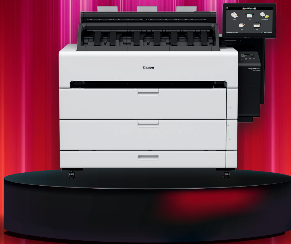
imagePROGRAF TZ-32000 MFP Z36